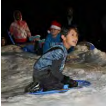
LIVING THE VIRIDIAN LIFE

Inspired By Nature. Rooted In Community.