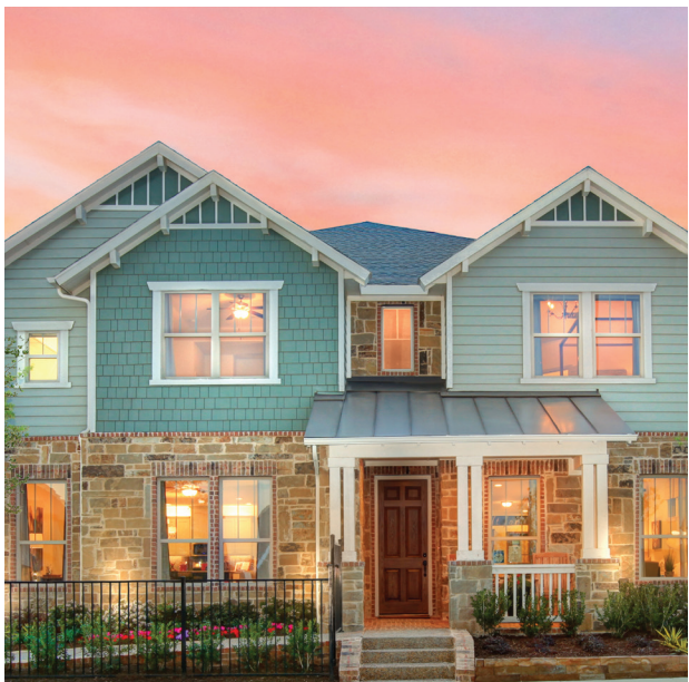
EXCITING NEW BUILDERS!