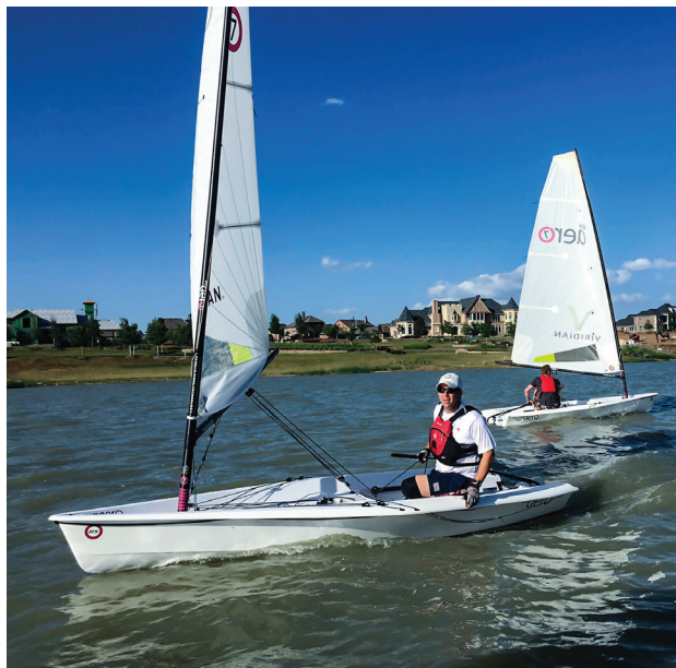
LIVING THE VIRIDIAN LIFE

Inspired By Nature. Rooted In Community.