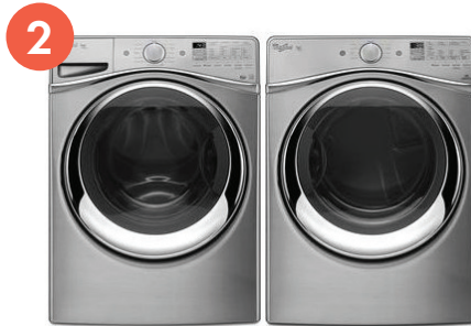
Washer & Dryer