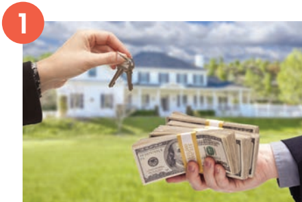
$1,500 in Closing Costs